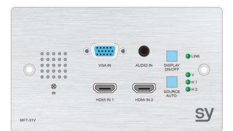
Figure 3 - SY-MFT-31V