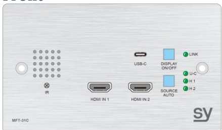
Figure 1 - SY-MFT-31C