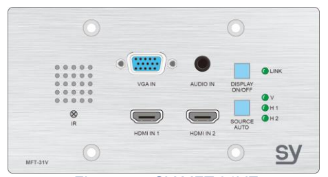
Figure 4 - SY-MFT-31VE