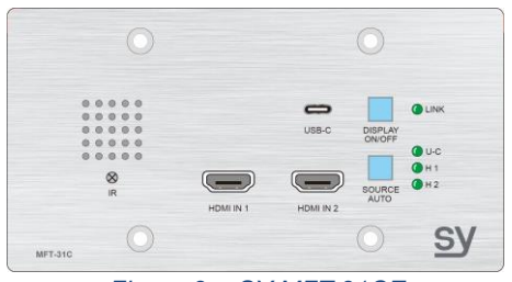
Figure 2 - SY-MFT-31CE